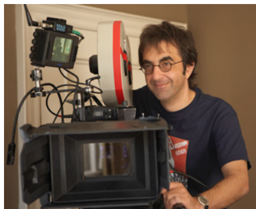
Cruel and Tender Director Atom Egoyan.

Oh, and remember we said Arsinée Khanjian will star as Amelia? This show marks the first time she and husband Egoyan will collaborate on a live theatre project. We think it's going to be pretty exciting!